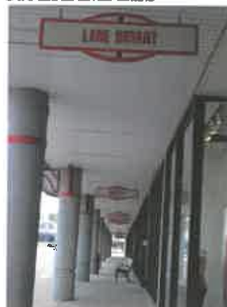
Illustration on the left shows under canopy sign and on the right a projecting sign